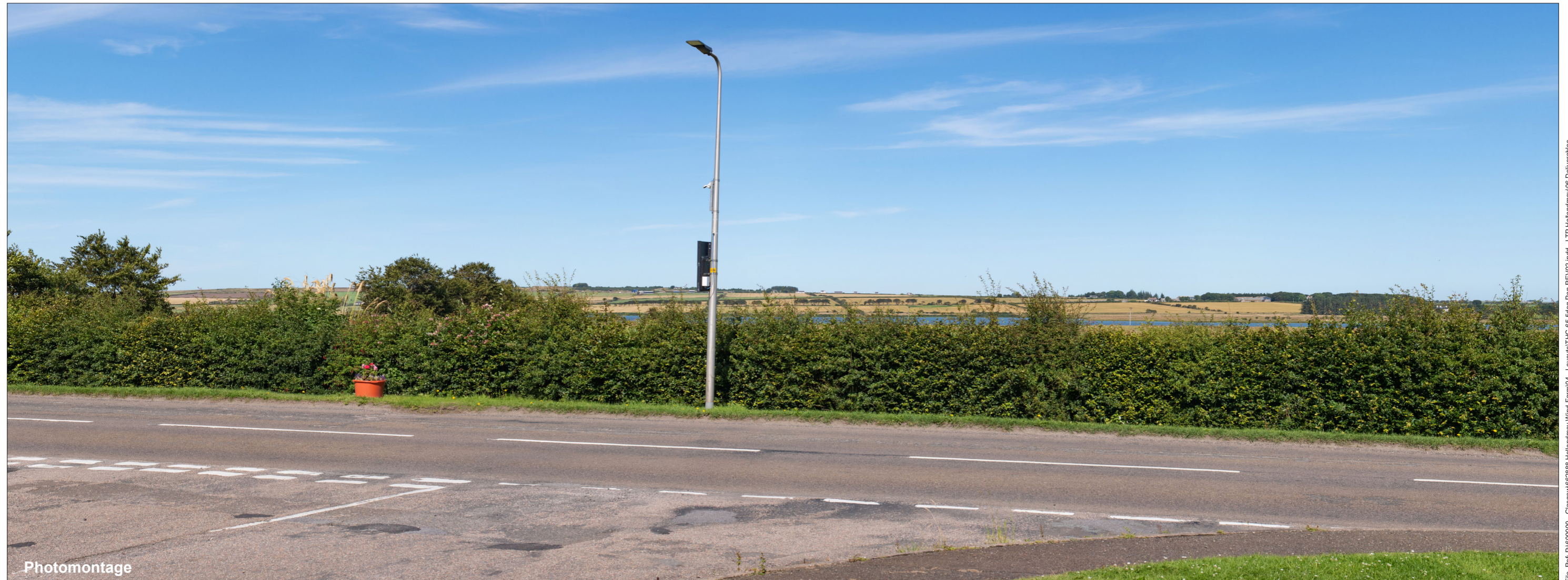
Figure: 7.30-THC-01 Viewpoint 17: Watten Photomontage: Planar Projection